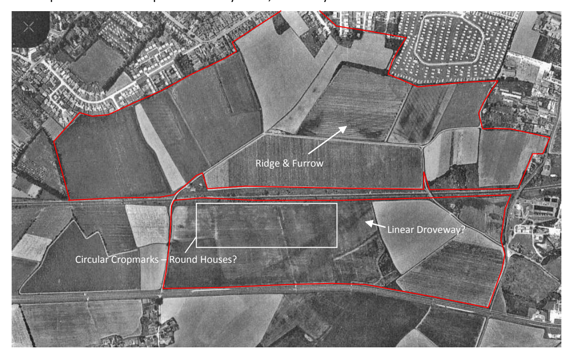
Figure 1 1967 Aerial Photograph

9.4.1 Careful examination of one aerial photograph was carried out. Feint traces of potential linear and sub circular features are present, along with ridge and furrow (Fig. 1). To the south of the existing railway line, northeast-southwest aligned linear cropmarks can be seen, possibly representing a series of droveways. To the immediate northwest and adjacent to the southern extent of the railway line, circular cropmarks are clearly visible (round houses, domestic enclosures etc). Such patterns form close parallels with archaeological remains recorded to the west at the Altira Business Park (Britchfield, forthcoming) which comprise a managed prehistoric landscape with field systems, droveways and round houses.